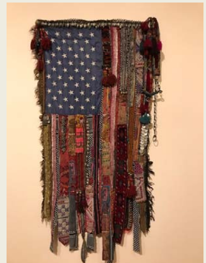
Museum of Art & Design